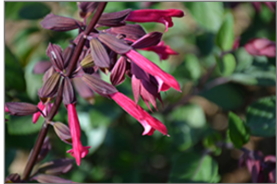
Skyscraper Dark Purple Salvia flowers