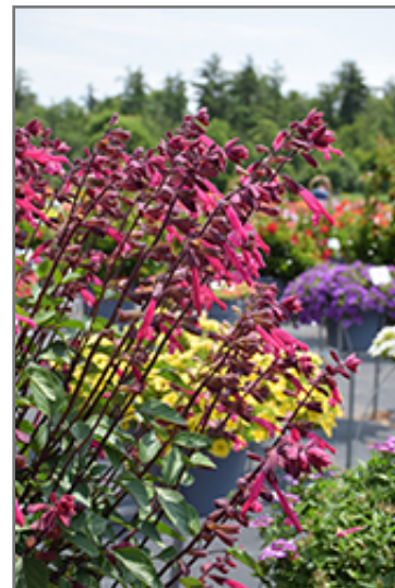
Skyscraper Dark Purple Salvia flowers

Skyscraper Dark Purple Salvia is an herbaceous annual with an upright spreading habit of growth. Its relatively fine texture sets it apart from other garden plants with less refined foliage.