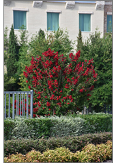
Double Dynamite Crapemyrtle in bloom

This shrub does best in full sun to partial shade. It prefers to grow in average to moist conditions, and shouldn't be allowed to dry out. It is very fussy about its soil conditions and must have rich, acidic soils to ensure success, and is subject to chlorosis (yellowing) of the foliage in alkaline soils. It is highly tolerant of urban pollution and will even thrive in inner city environments. This is a selected variety of a species not originally from North America.