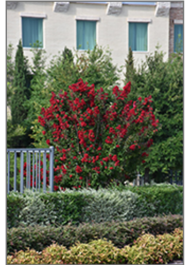
Double Dynamite Crapemyrtle in bloom

This shrub does best in full sun to partial shade. It prefers to grow in average to moist conditions, and shouldn't be allowed to dry out. It is very fussy about its soil conditions and must have rich, acidic soils to ensure success, and is subject to chlorosis (yellowing) of the foliage in alkaline soils. It is highly tolerant of urban pollution and will even thrive in inner city environments. This is a selected variety of a species not originally from North America.