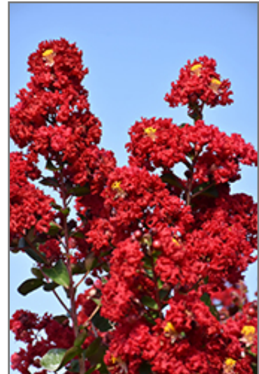
Double Dynamite Crapemyrtle flowers