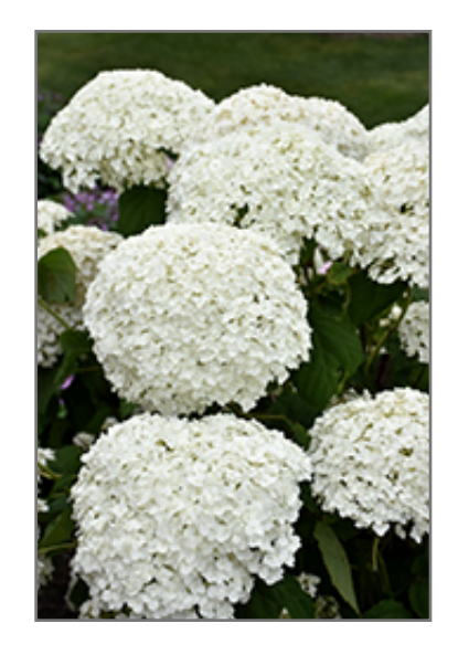
Lil' Annie Hydrangea flowers

830 W Liberty Dr. Liberty, MO 64068 816.781.0001