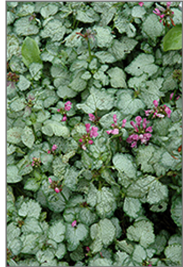
Beacon Silver Spotted Dead Nettle flowers