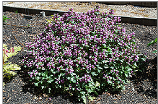
Beacon Silver Spotted Dead Nettle in bloom