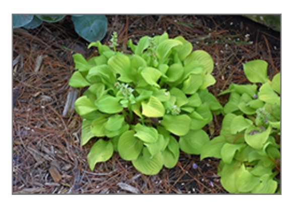
Sun Mouse Hosta

7036 Nieman Shawnee, KS 66203 913.631.6121