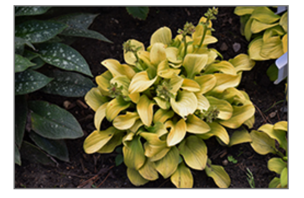
Sun Mouse Hosta

Sun Mouse Hosta is recommended for the following landscape applications;