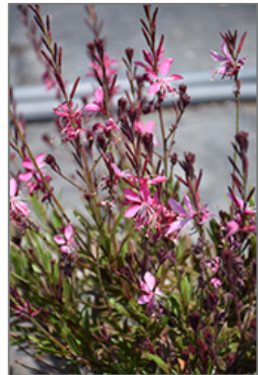
Whiskers Deep Rose Gaura flowers