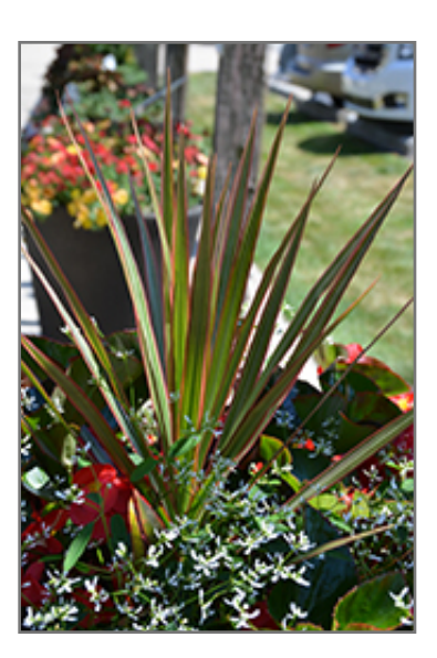
Cordylena Ruby Madagascar Dragon Tree flowers

When grown indoors, Cordylena Ruby Madagascar Dragon Tree can be expected to grow to be about 4 feet tall at maturity, with a spread of 24 inches. It grows at a medium rate, and under ideal conditions can be expected to live for approximately 10 years. This houseplant will do well in a location that gets either direct or indirect sunlight, although it will usually require a more brightly-lit environment than what artificial indoor lighting alone can provide. It does best in average to evenly moist soil, but will not tolerate standing water. The surface of the soil shouldn't be allowed to dry out completely, and so you should expect to water this plant once and possibly even twice each week. Be aware that your particular watering schedule may vary depending on its location in the room, the pot size, plant size and other conditions; if in doubt, ask one of our experts in the store for advice. It is not particular as to soil type or pH; an average potting soil should work just fine.