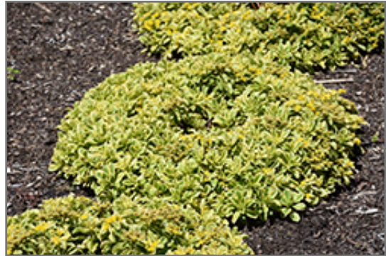
Cutting Edge Stonecrop

Cutting Edge Stonecrop will grow to be only 6 inches tall at maturity, with a spread of 16 inches. When grown in masses or used as a bedding plant, individual plants should be spaced approximately 12 inches apart. Its foliage tends to remain low and dense right to the ground. It grows at a fast rate, and under ideal conditions can be expected to live for approximately 15 years. As an herbaceous perennial, this plant will usually die back to the crown each winter, and will regrow from the base each spring. Be careful not to disturb the crown in late winter when it may not be readily seen!