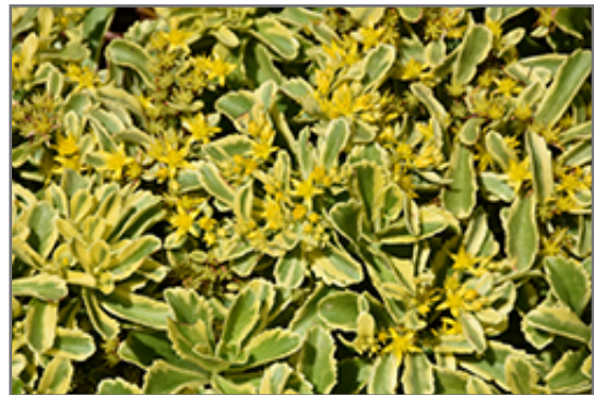
Cutting Edge Stonecrop flowers