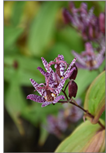
Toad Lily flowers