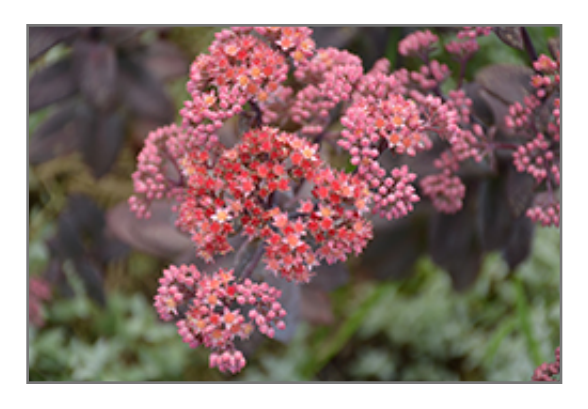
Night Embers Stonecrop flowers