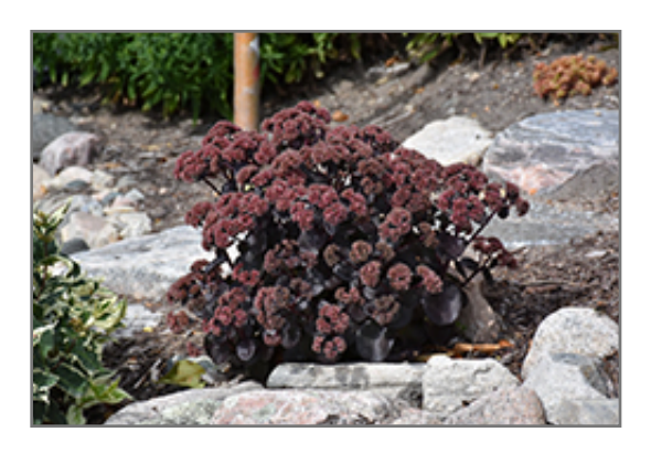
Night Embers Stonecrop in bloom

Night Embers Stonecrop is a dense herbaceous perennial with an upright spreading habit of growth. Its relatively coarse texture can be used to stand it apart from other garden plants with finer foliage.