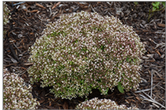
Rock 'N Round Bundle Of Joy Stonecrop in bloom