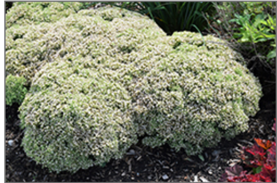
Rock 'N Round Bundle Of Joy Stonecrop in bloom

This is a relatively low maintenance plant, and is best cleaned up in early spring before it resumes active growth for the season. It is a good choice for attracting bees and butterflies to your yard, but is not particularly attractive to deer who tend to leave it alone in favor of tastier treats. It has no significant negative characteristics.