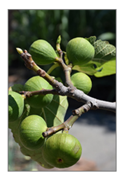
Black Jack Fig fruit