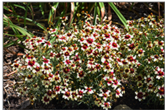
Sizzle And Spice Red Hot Vanilla Tickseed in bloom