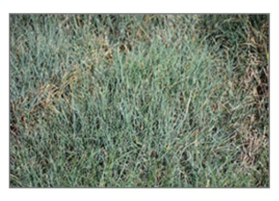
Blue Zinger Blue Sedge foliage

8424 Farley St. Overland Park, KS 66212 913.642.6503