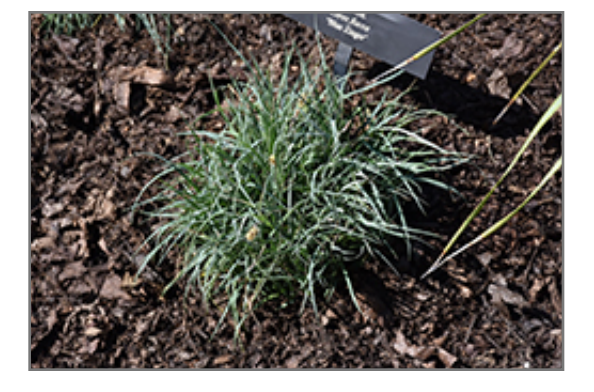
Blue Zinger Blue Sedge