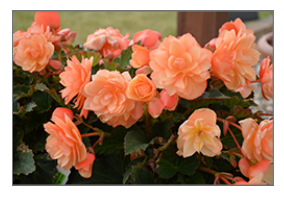
Fragrant Falls Peach Begonia flowers