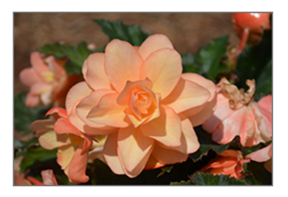
Fragrant Falls Peach Begonia flowers

830 W Liberty Dr. Liberty, MO 64068 816.781.0001