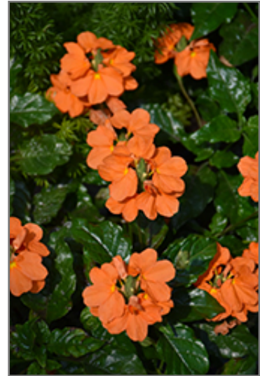
Orange Marmalade Firecracker Plant flowers

This plant does best in full sun to partial shade. It does best in average to evenly moist conditions, but will not tolerate standing water. It is not particular as to soil pH, but grows best in rich soils. It is somewhat tolerant of urban pollution. This is a selected variety of a species not originally from North America. It can be propagated by cuttings; however, as a cultivated variety, be aware that it may be subject to certain restrictions or prohibitions on propagation.