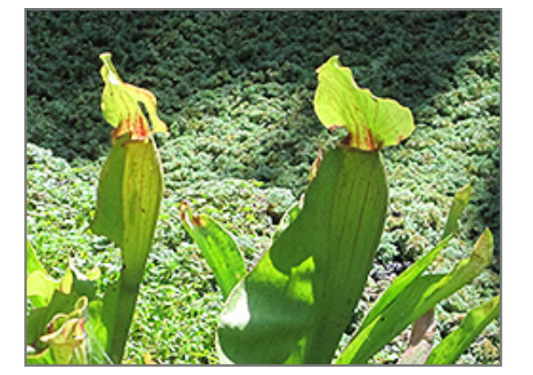
Northern Pitcher Plant

7036 Nieman Shawnee, KS 66203 913.631.6121