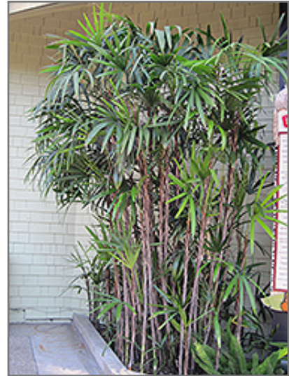
Slender Lady Palm