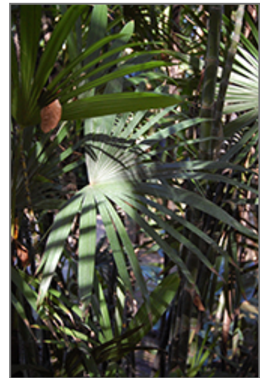
Slender Lady Palm foliage