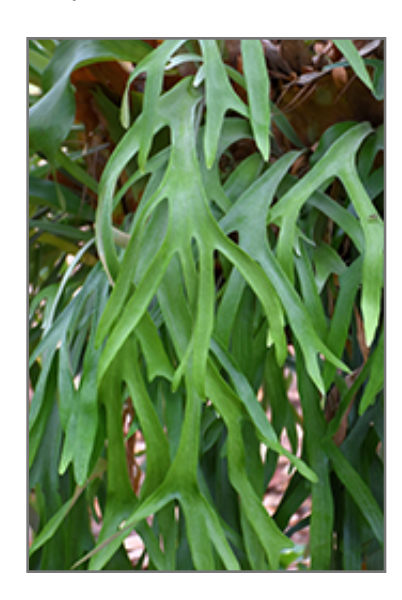
Staghorn Fern foliage