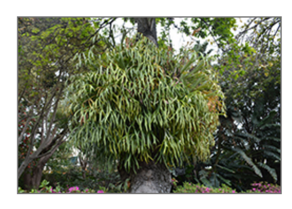
Staghorn Fern