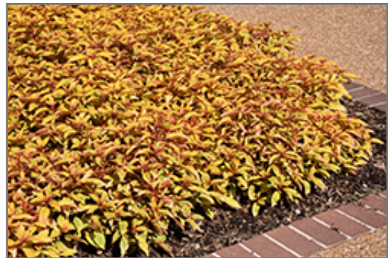
Lime Sizzler Firebush

Lime Sizzler Firebush features showy cymes of scarlet tubular flowers with orange overtones at the ends of the branches from late spring to mid fall. Its attractive pointy leaves emerge coppery-bronze in spring, turning yellow in color with showy light green variegation and tinges of peach the rest of the year. It features an abundance of magnificent plum purple berries in early fall. The red stems can be quite attractive.