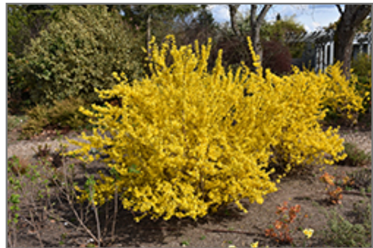
Magical Gold Forsythia in bloom