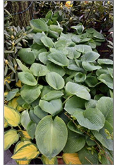
Elegans Hosta

Elegans Hosta is recommended for the following landscape applications;