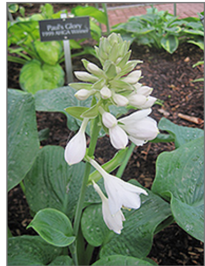
Elegans Hosta flowers