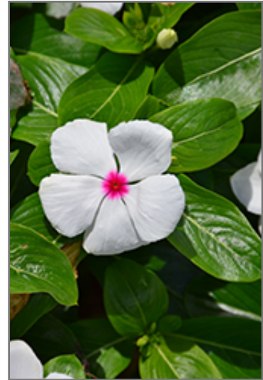
Mega Bloom Polka Dot Vinca flowers

Mega Bloom Polka Dot Vinca is recommended for the following landscape applications;