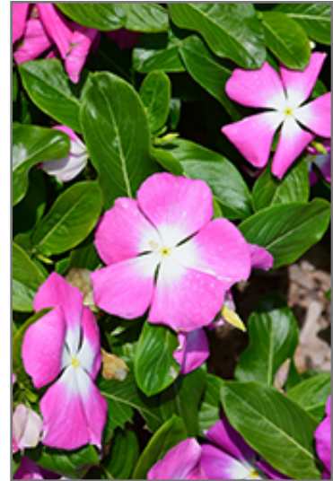
Mega Bloom Pink Halo Vinca flowers

This plant will require occasional maintenance and upkeep, and should not require much pruning, except when necessary, such as to remove dieback. It is a good choice for attracting butterflies to your yard, but is not particularly attractive to deer who tend to leave it alone in favor of tastier treats. It has no significant negative characteristics.