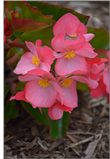
Megawatt Rose Green Leaf Begonia flowers

Megawatt Rose Green Leaf Begonia is an herbaceous annual with an upright spreading habit of growth. Its medium texture blends into the garden, but can always be balanced by a couple of finer or coarser plants for an effective composition.