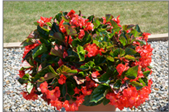
Megawatt Red Green Leaf Begonia in bloom