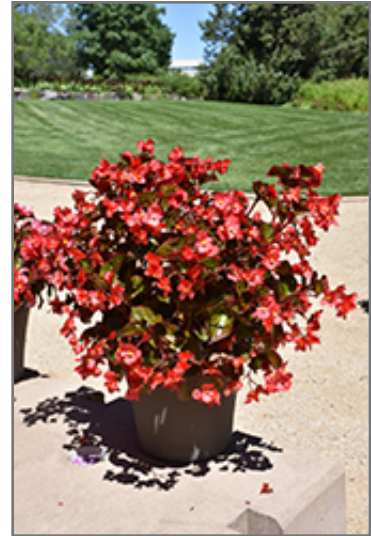
Megawatt Red Bronze Leaf Begonia flowers

Megawatt Red Bronze Leaf Begonia is a fine choice for the garden, but it is also a good selection for planting in outdoor containers and hanging baskets. With its upright habit of growth, it is best suited for use as a 'thriller' in the 'spiller-thriller-filler' container combination; plant it near the center of the pot, surrounded by smaller plants and those that spill over the edges. It is even sizeable enough that it can be grown alone in a suitable container. Note that when growing plants in outdoor containers and baskets, they may require more frequent waterings than they would in the yard or garden.