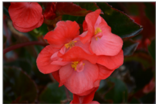
Megawatt Red Bronze Leaf Begonia flowers