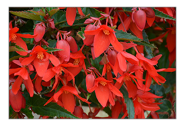
Waterfall Encanto Red Begonia flowers

830 W Liberty Dr. Liberty, MO 64068 816.781.0001