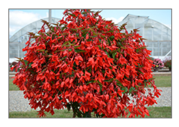
Waterfall Encanto Red Begonia in bloom