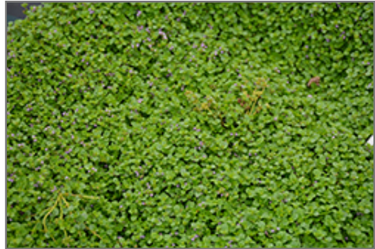
Mini Mint Ornamental Mint

Mini Mint Ornamental Mint is recommended for the following landscape applications;