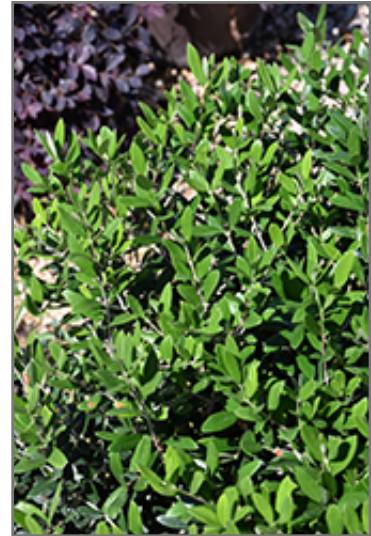
Little Ollie&reg Dwarf Olive foliage

Little Ollie&reg Dwarf Olive makes a fine choice for the outdoor landscape, but it is also well-suited for use in outdoor pots and containers. With its upright habit of growth, it is best suited for use as a 'thriller' in the 'spiller-thriller-filler' container combination; plant it near the center of the pot, surrounded by smaller plants and those that spill over the edges. It is even sizeable enough that it can be grown alone in a suitable container. Note that when grown in a container, it may not perform exactly as indicated on the tag - this is to be expected. Also note that when growing plants in outdoor containers and baskets, they may require more frequent waterings than they would in the yard or garden.