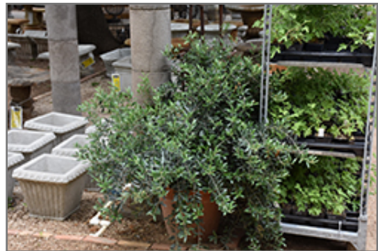
Little Ollie&reg Dwarf Olive