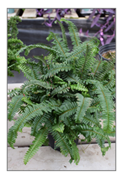
Kimberley Queen Australian Sword Fern in full

830 W Liberty Dr. Liberty, MO 64068 816.781.0001