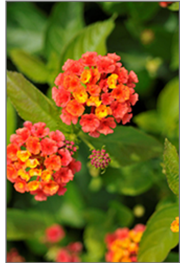
Landscape Bandana Red Lantana flowers

Landscape Bandana Red Lantana is recommended for the following landscape applications;