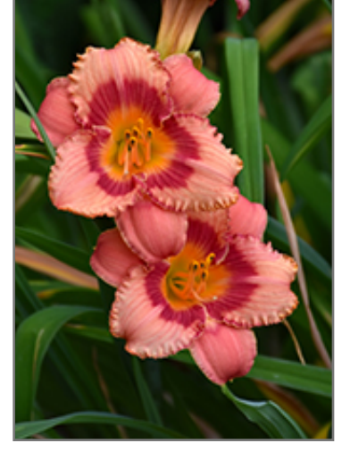
cherry red ruffled edges and eyezones; reblooming habit, a great way to Strawberry Candy Daylily flowers add color to borders and beds throughout the summer months