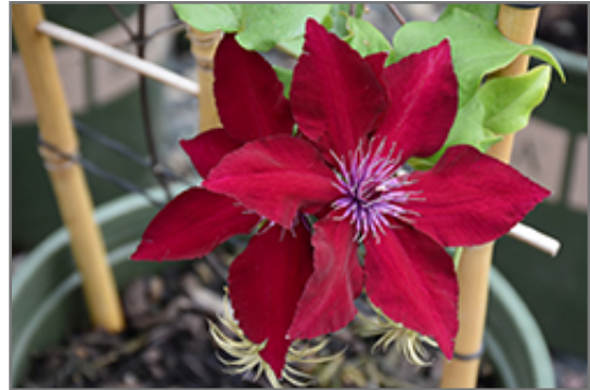
Boulevard Nubia Clematis flowers

Boulevard Nubia Clematis is recommended for the following landscape applications;