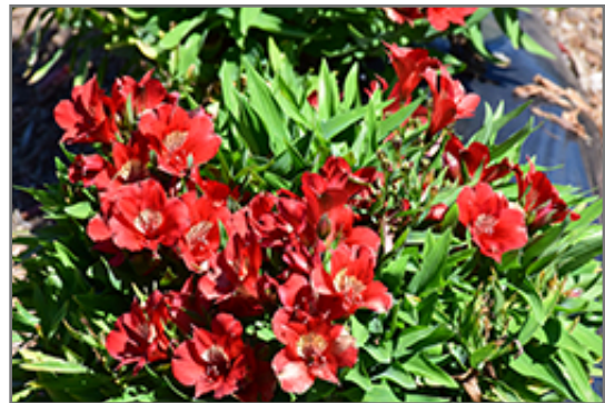
Colorita Kate Alstroemeria in bloom