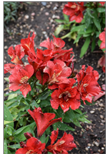
Colorita Kate Alstroemeria flowers