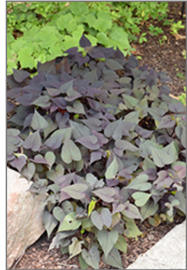
Sweet Georgia Heart Purple Sweet Potato Vine