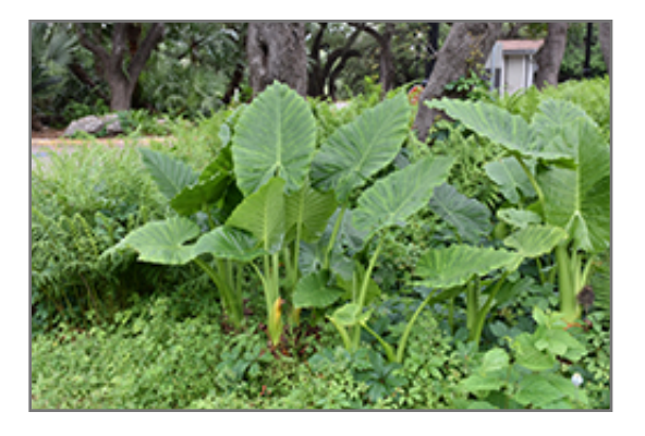
Borneo Giant Elephant's Ear

830 W Liberty Dr. Liberty, MO 64068 816.781.0001