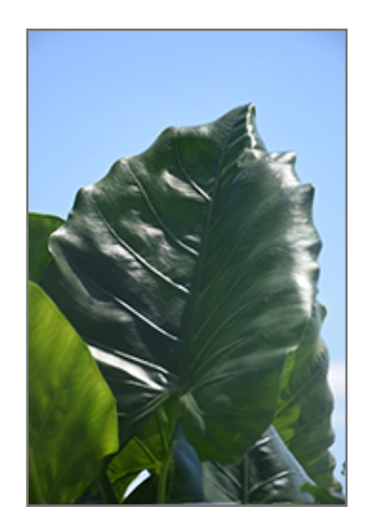
Borneo Giant Elephant's Ear foliage