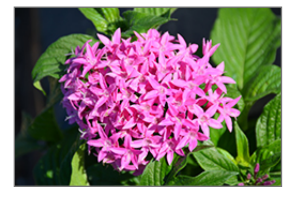
Butterfly Orchid Star Flower flowers

830 W Liberty Dr. Liberty, MO 64068 816.781.0001