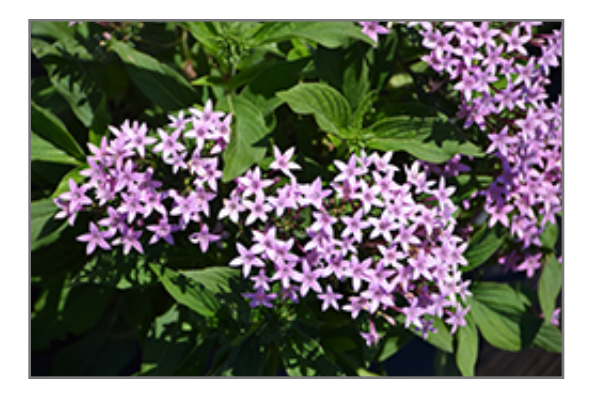
Butterfly Light Lavender Star Flower flowers

830 W Liberty Dr. Liberty, MO 64068 816.781.0001