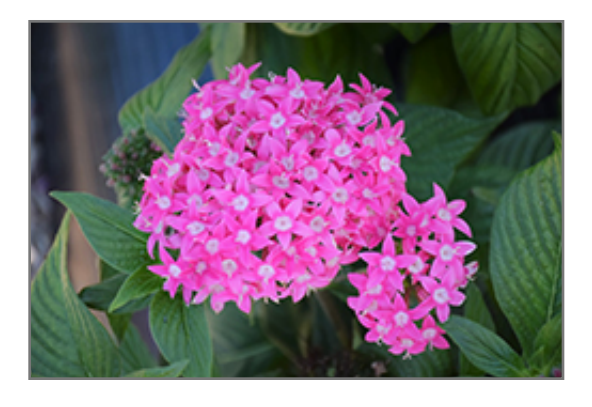
Butterfly Deep Pink Star Flower flowers

830 W Liberty Dr. Liberty, MO 64068 816.781.0001