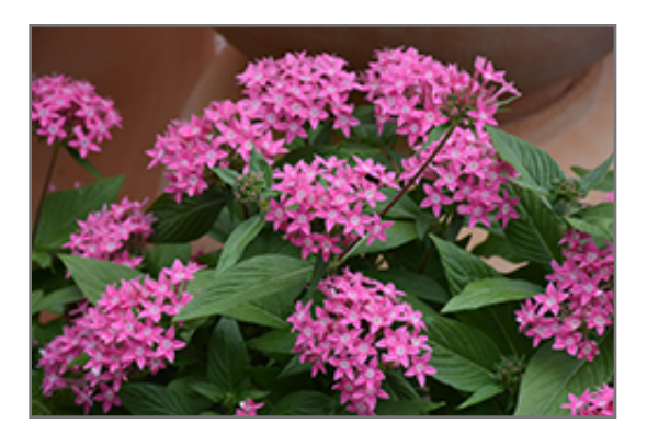
Butterfly Deep Pink Star Flower flowers