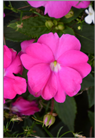
SunPatiens Compact Neon Pink New Guinea Impatiens flowers

This plant will require occasional maintenance and upkeep, and should not require much pruning, except when necessary, such as to remove dieback. It is a good choice for attracting bees and butterflies to your yard. It has no significant negative characteristics.