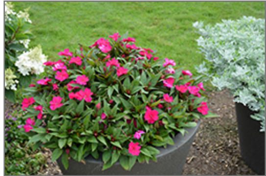
SunPatiens Compact Neon Pink New Guinea Impatiens in bloom

SunPatiens Compact Neon Pink New Guinea Impatiens will grow to be about 24 inches tall at maturity, with a spread of 24 inches. When grown in masses or used as a bedding plant, individual plants should be spaced approximately 20 inches apart. Its foliage tends to remain dense right to the ground, not requiring facer plants in front. This fast-growing annual will normally live for one full growing season, needing replacement the following year.