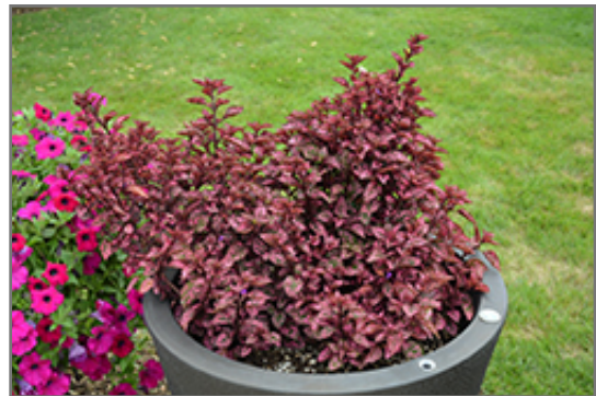
Hippo Rose Polka Dot Plant