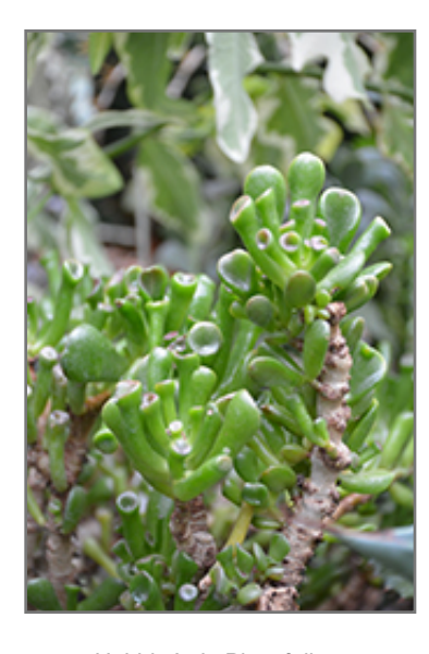
Hobbit Jade Plant foliage

This is a relatively low maintenance shrub, and can be pruned at anytime. It is a good choice for attracting bees and butterflies to your yard, but is not particularly attractive to deer who tend to leave it alone in favor of tastier treats. It has no significant negative characteristics.