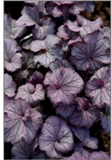
Northern Exposure Silver Coral Bells foliage

Northern Exposure Silver Coral Bells is recommended for the following landscape applications;