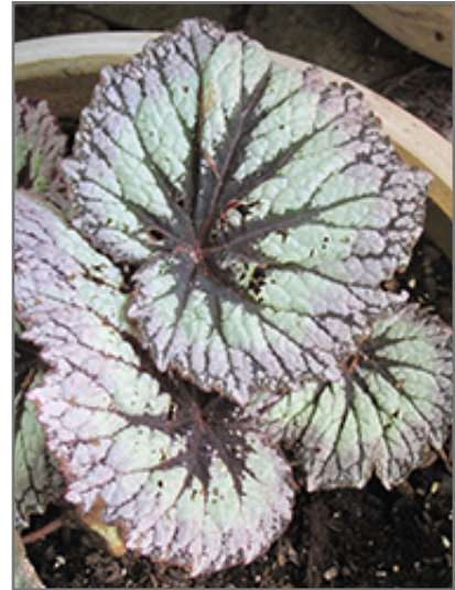
Fireworks Begonia foliage

An outstanding begonia with striking silver-white leaves with rosy edges, and deep burgundy veins for a visual impact in the garden; pink blooms add to the appeal; upright habit; an attractive indoor accent plant