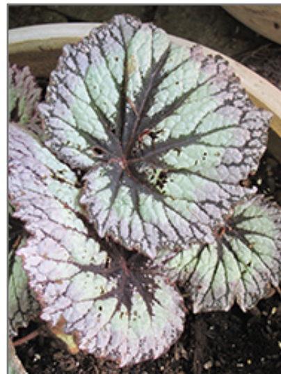
Fireworks Begonia foliage

An outstanding begonia with striking silver-white leaves with rosy edges, and deep burgundy veins for a visual impact in the garden; pink blooms add to the appeal; upright habit; an attractive indoor accent plant