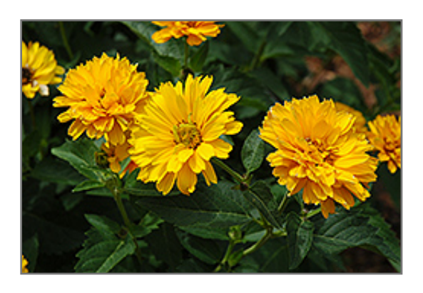
Summer Sun False Sunflower flowers

830 W Liberty Dr. Liberty, MO 64068 816.781.0001