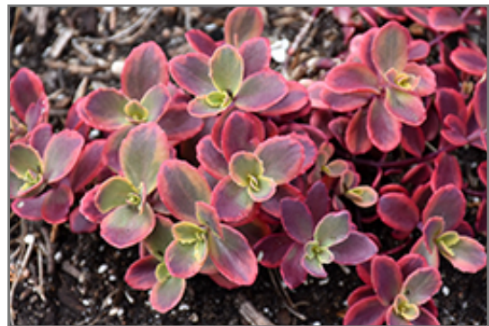
Sunsparkler Wildfire Stonecrop foliage