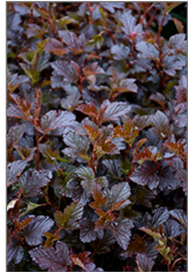
Petite Plum Ninebark foliage