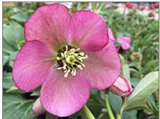
Honeymoon Paris In Pink Hellebore flowers