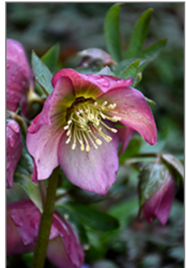
Honeymoon Paris In Pink Hellebore flowers

Honeymoon Paris In Pink Hellebore is recommended for the following landscape applications;