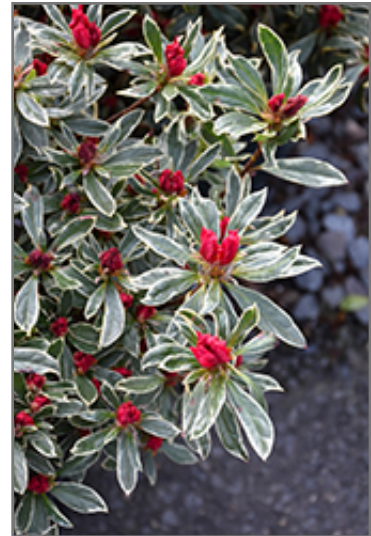
Silver Sword Azalea foliage